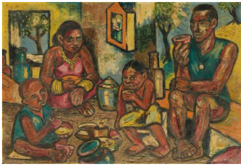
PROPERTY FROM AN ESTEEMED PRIVATE COLLECTION FRANCIS NEWTON SOUZA (1924-2002) FAMILY OIL ON CARD LAID ON BOARD. PAINTED IN 1946. PRICE REALIZED: $822,000 WORLD AUCTION RECORD FOR THE ARTIST IN THE MEDIUM