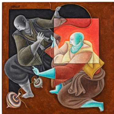
PROPERTY FROM A DISTINGUISHED EAST COAST COLLECTION SATISH GUJRAL (1925-2020) UNTITLED (MEN AT PLAY) PRICE REALIZED: $60,000

Important Chinese Ceramics and Works of Art achieved a total of $16,507,625 with 89% sold by lot, 93% sold by value, and 212% hammer above low estimate. The top lot of the sale was a rare 17th century huanghuali incense stand from the Yunwai Lou collection, which achieved $2,550,000 against a low estimate of $800,000. Other notable results included a magnificent and very rare large lacquered and gilt wood seated figure of Manjushri, Kangxi period (1662-1722) that realized $1,350,000; and a rare huanghuali kang table, 18th-19th century, that sold for $1,614,000 and set the world auction record for a kang table. Browse the sale results here.