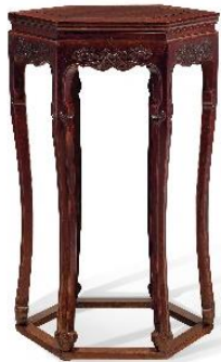
PROPERTY FROM THE YUNWAI LOU COLLECTION AN IMPORTANT AND EXCEPTIONALLY RARE HEXAGONAL HUANGHUALI INCENSE STAND, XIANGJI 17TH CENTURY PRICE REALIZED: $2,550,000

Important Chinese Art from the Junkunc Collection achieved a total of $5,951,500 with 87% sold by lot, 94% sold by value, and 185% hammer above low estimate. The top lot of the sale was a finely carved white jade figure of a mythical beast from the 17th-18th century that sold for $525,000. Other notable results included a very rare pale beigish-white and yellowish-brown camel dated to the Tang-Yuan dynasty that sold for $437,500; a rare miniature yellow jade faceted jar and cover dated to the Qianlong period or earlier that realized $375,000; a rare gilt-silver sheath dated to the Liao-Yuan dynasty, which sold for $187,500; and a 14th-early 18th century archaic silver and gold-inlaid bronze jar, once in the Qianlong Emperor's collection that achieved $250,000. Browse the sale results here.