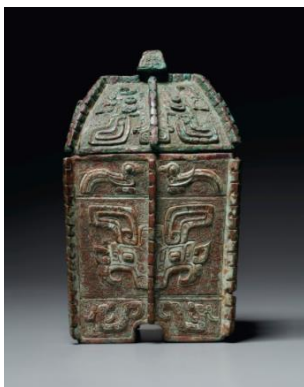
A VERY RARE BRONZE RITUAL WINE VESSEL AND COVER, FANGYI, LATE SHANG DYNASTY, ANYANG, 12TH CENTURY BC PRICE REALIZED: $1,110,000

Christie's sale of Indian, Himalayan and Southeast Asian Works of Art achieved a total of $7,272,750 with 85% sold by lot and 89% sold by value. The top lot of the sale was a magnificent and monumental gray schist figure of Buddha Shakyamuni that sold for $1,950,000. Other highlights include a rare painting of the patron, Hvashang that sold for $750,000 and an illustration from the 'Lambagraon' Gita Govinda series that sold for $575,000. Browse sale results here.