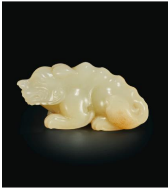
A FINELY CARVED WHITE JADE FIGURE OF A MYTHICAL BEAST 17TH-18TH CENTURY PRICE REALIZED: $525,000