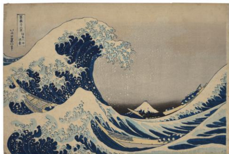
KATSUSHIKA HOKUSAI (1760-1849) KANAGAWA OKI NAMI URA (UNDER THE WELL OF THE GREAT WAVE OFF KANAGAWA) PRICE REALIZED: $1,590,000